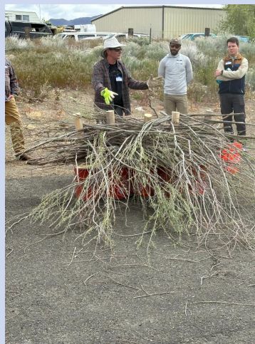
An instructor describes how a Post Assisted Log Structure can slow water flow and assist in sediment deposition to improve riparian areas.