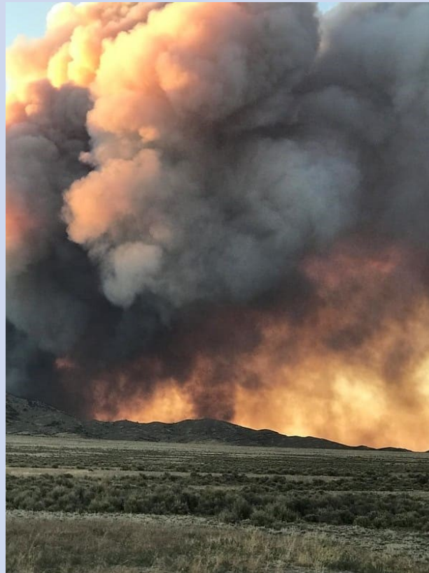
Photo Cutline: The Hogan Fire, which started on July 1, 2018, approximately 25 miles southeast of Wells, Nevada, burned more than 10,000 acres before it was fully contained on July 19, 2018.