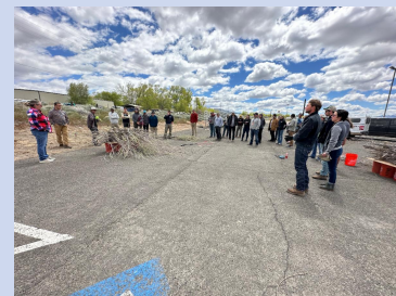
Attendees constructed structures in the parking lot to learn techniques used in field applications.