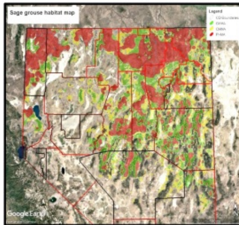
Map of State with Sage grouse habitat highlighted, and CD boundaries shown.

Please reach out to your local Conservation District, or to one of our Conservation District Program Staff Specialists to work on your proposals today! Due June 30 th , 2024