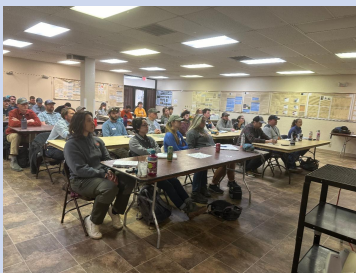
Day one classroom topics included examples of successful restoration projects, site selection, techniques for installation and permitting.